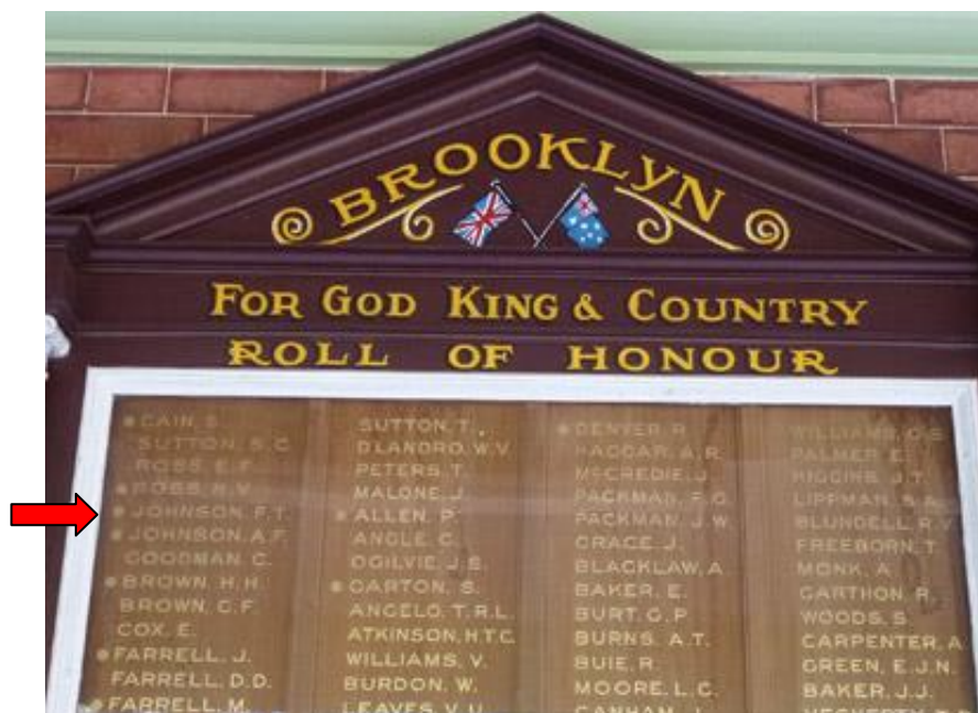
Brooklyn Roll of Honour (Photos from Register of War Memorial in NSW)